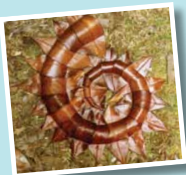
Leaves polished and greased, pinned to the ground with thorns.

Why don't you try making one next time you visit the coast?